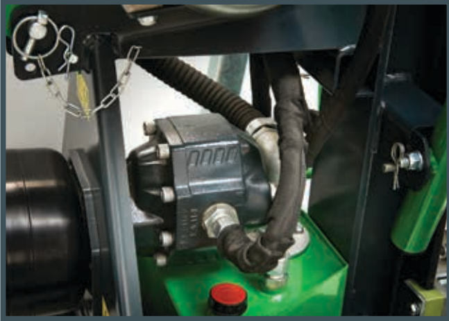
• Premium cast iron pump