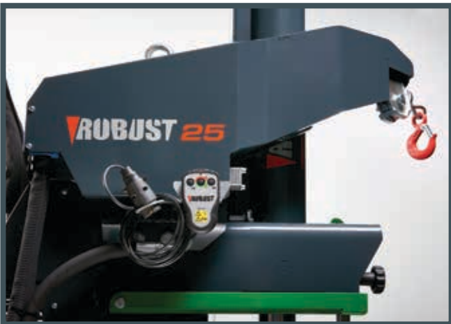
• Hydraulic winch (tractive force of 540 kg, 15 or 20 m cable) – mechanical or remote control