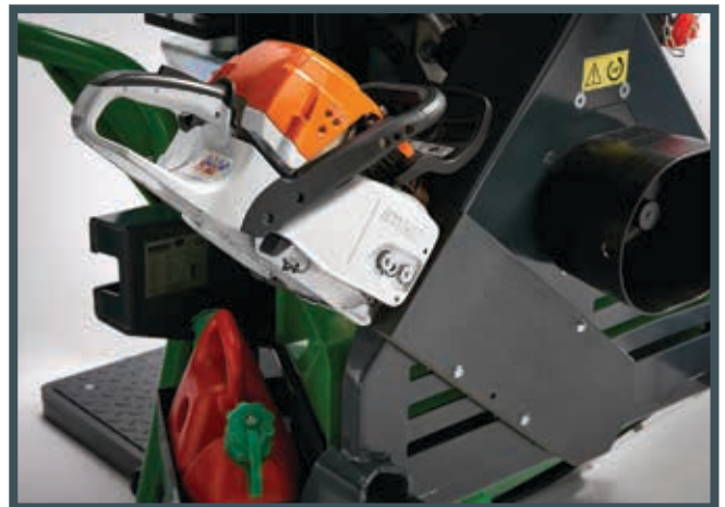
• Chainsaw holder