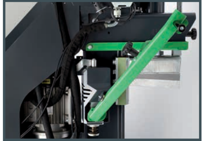
• Switch lever with gas damper