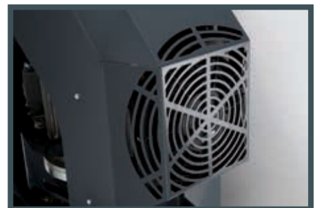
• Cooling system