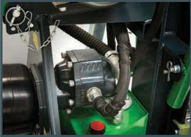
• Cast iron pump