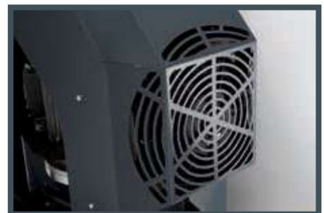
• Cooling system