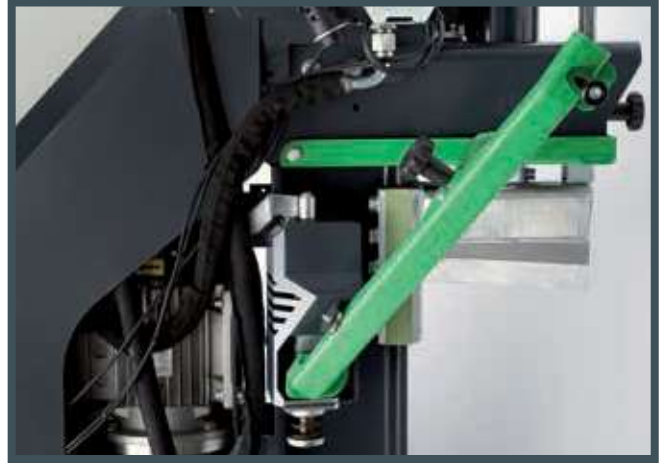
• Gas handle