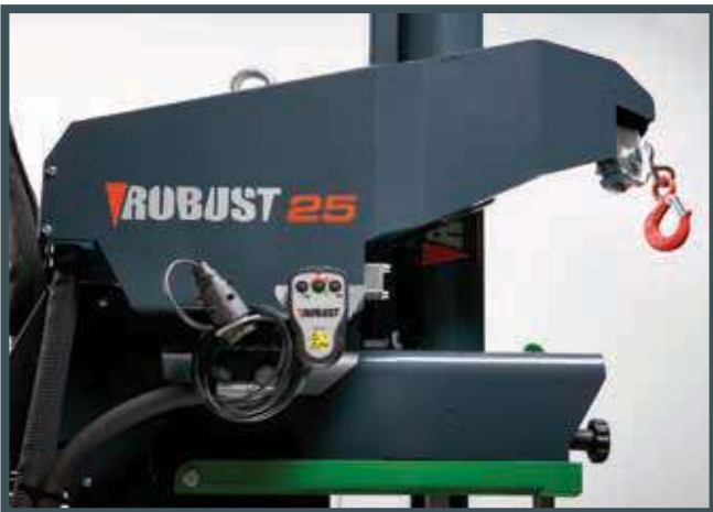
• Hydraulic winch(540 kg, 15 ali 20 m) – mechanical or remote control