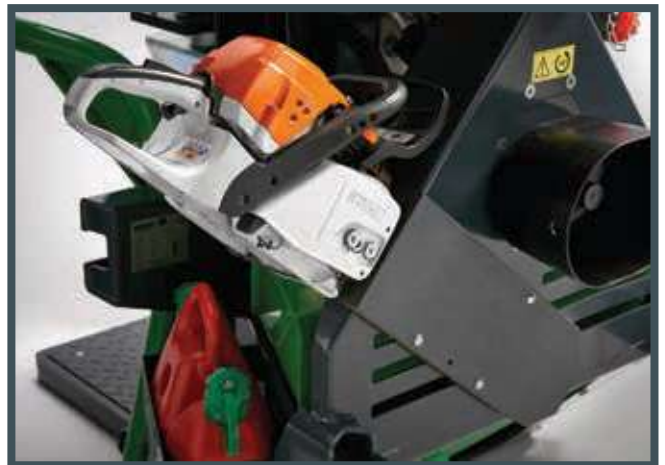
• Chainsaw holder