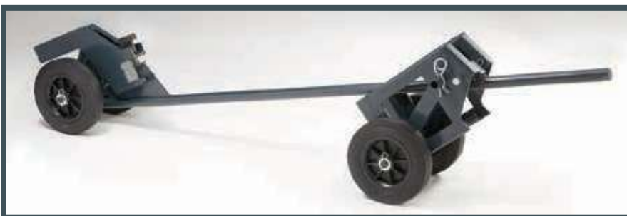
• Manual transport cart